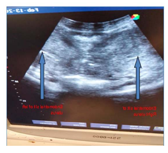
Figure 2: postoperative sonographic image of didelphys showing two endometrial slit.

The mother's postoperative recovery was uneventful. After written consent has been collected and preserved, post-operative sonography was repeated (Figure 2) and vaginal speculum examination done (Figure 3).