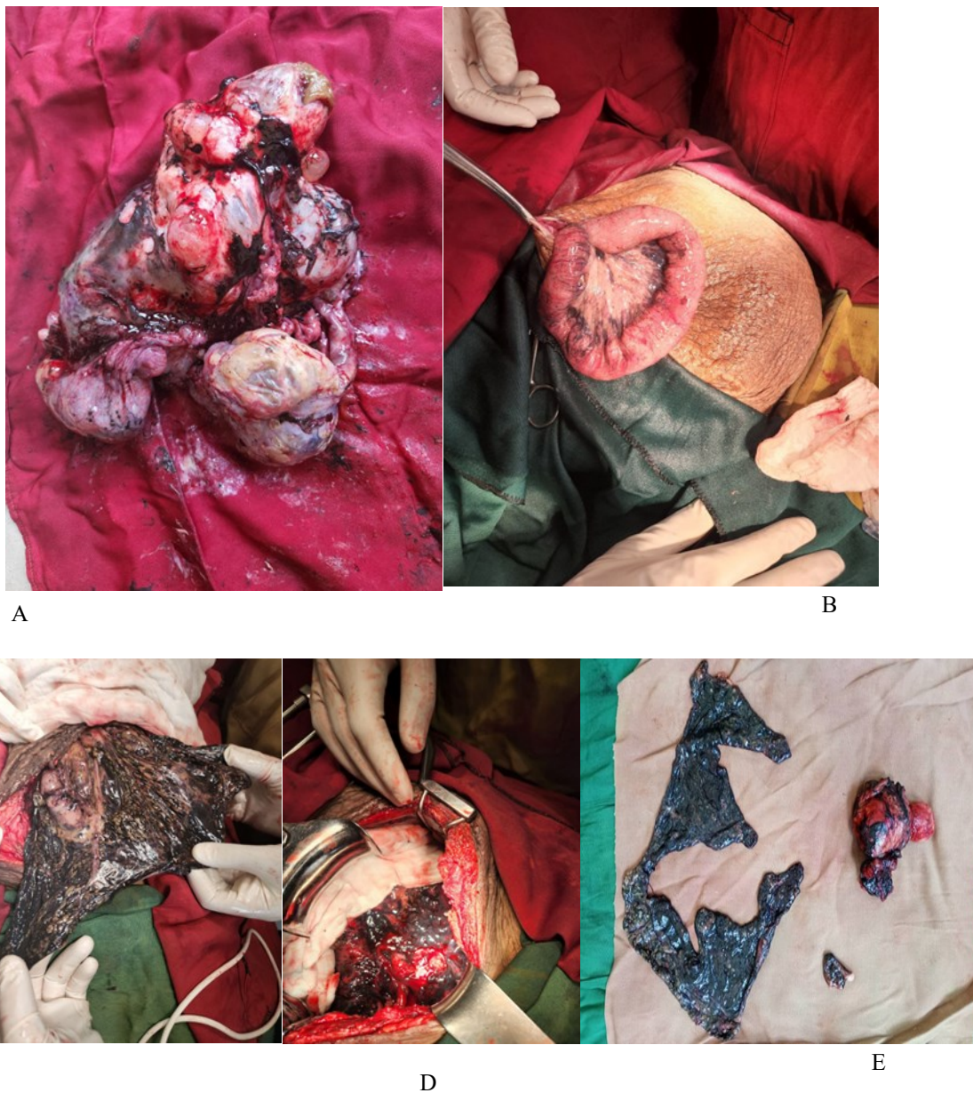
Figure 2. A) multi lobulated ovarian mass with ruptured capsule, there are black colored staining of the surface. B) there is black staining of the mesentery and bowel surface C), D) and E) Dark brown pigmentation of omentum pelvic peritoneum uterus, ovarian surface and Appendix

multiple small nodules of size about 1cm on the omentum (Figure 2). The cytoreductive surgery performed carefully by the team of gynecologic surgeons lead by the same senior gynecologic oncologist and there were no intra- or postoperative complications.