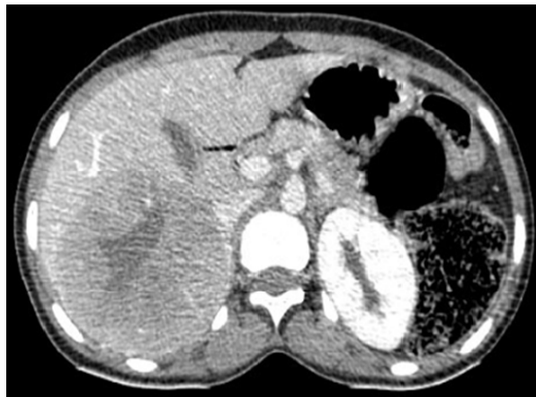
Fig.2. Abdominal CT showing capsulated right suprarenal mass.