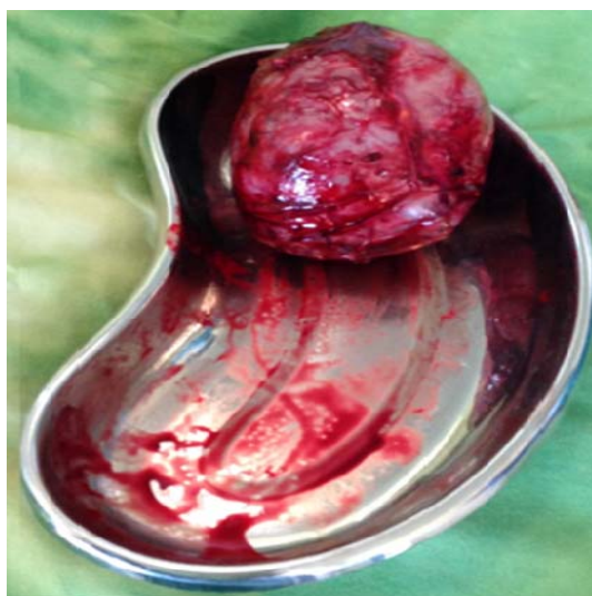
Fig.4. Specimen of the excised right adrenal gland

Through right sub-costal incision the abdomen was entered, the right triangular ligament was divided and the peritoneum lateral to the hepatic flexure was incised to expose the adrenal. Dissection was started from the medial side developing a plane between the adrenal and IVC (inferior vena cava). There were small veins draining in to the renal vein, which were divided after ligation. The main adrenal vein draining to the postrolateral side of IVC was ligated and divided then the mass was excised in to two and sent for pathologic exam. ( Fig. 4).