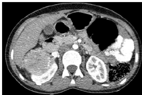
Fig.3. Abdominal CT showing right suprarenal mass flattening upper pole of the right kidney

Twenty four hour urine catecholamine and metanephrine were determined and the results were as depicted on Table1.