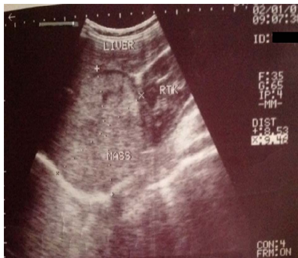
Fig.1. Abdominal Ultrasound showing right suprarenal mass.

Abdominal ultrasound revealed 8.5x9.5cm right adrenal mass (Fig.1) and CT of abdomen showed a 9 cm diameter right adrenal capsulated mass with no invasion to the surrounding structures (Fig. 2,3).